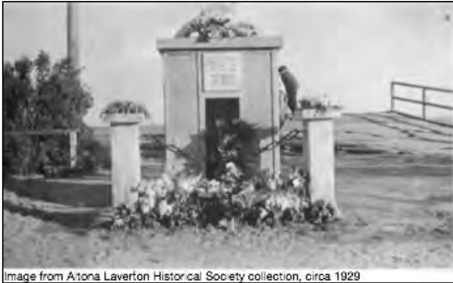
Image from Altona Laverton Historical Society collection, circa 1929