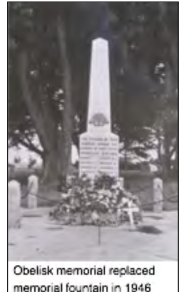
Obelisk memorial replaced memorial fountain in 1946

At the end of WWII the memorial was less than 20 years old and experiencing problems with drifting sands threatening its stability and repeated complaints to police, council and Altona RSL from parents of teenage girls who had been physically assaulted when bending over to drink from the fountain. At a joint meeting between members of Werribee council and the Altona RSL in 1946, it was agreed to replace the memorial fountain with a new obelisk memorial in Altona Park (Logan Reserve) on the corner of Queen and Pier Streets.