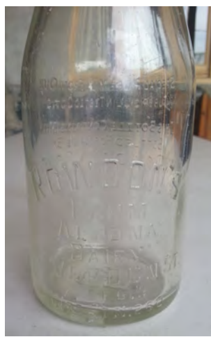
The museum's collection includes a glass milk bottle from Rowdon's Dairy, Altona

Cattle used to roam freely on an open paddock at the north end of Pier Street, Altona in the vicinity of where the dry cleaners is now, until council decreed such paddocks needed to be fenced.