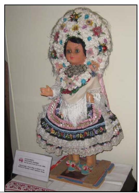
Currently on display at the Homestead in support of the Hobsons Bay Seniors Festival is a display of memorabilia lent by Seniors from the local area, this includes a collection of Slovak costumes and above is a Slovak Bride doll in Traditional ensemble.