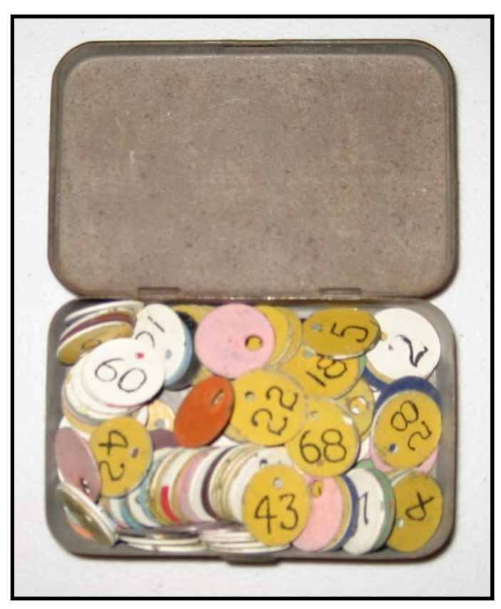
The objects above are in the Homestead Museum Collection, they are hand painted metal discs with numbers on them and holes which indicate that they may have been hung on hooks for display, perhaps used in a game.