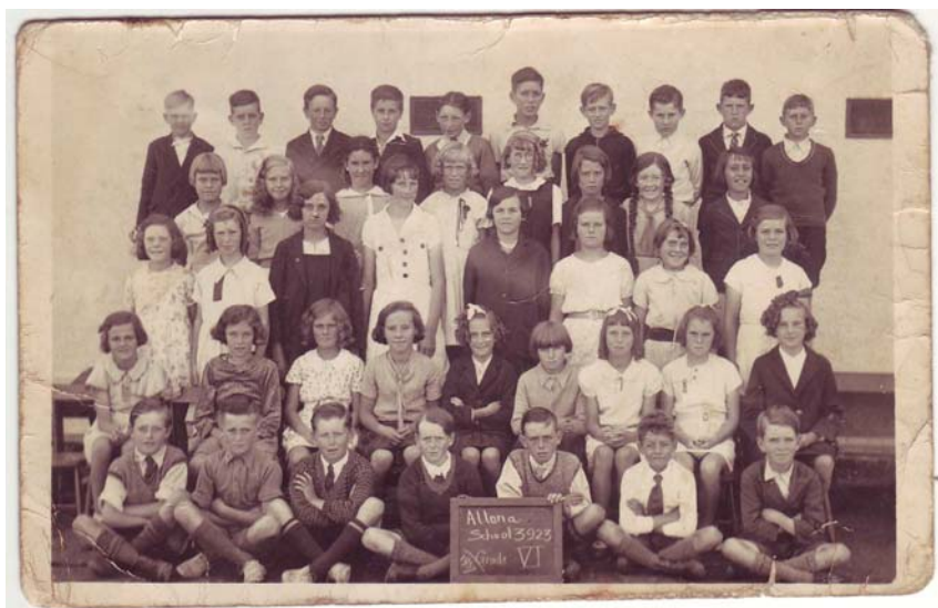
Altona School 3923 Grade VI-1937